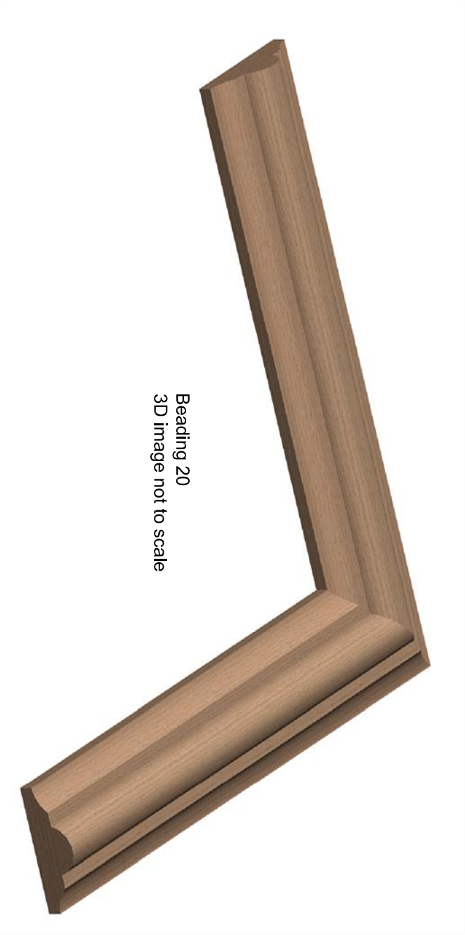
Beading 20 3D image not to scale